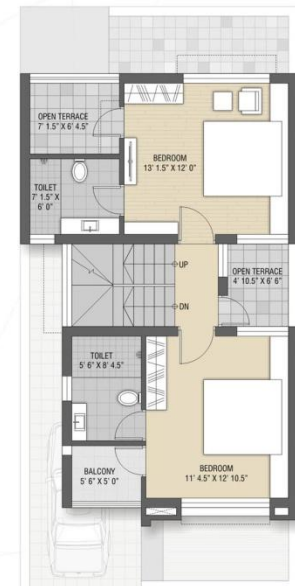
first floor plan