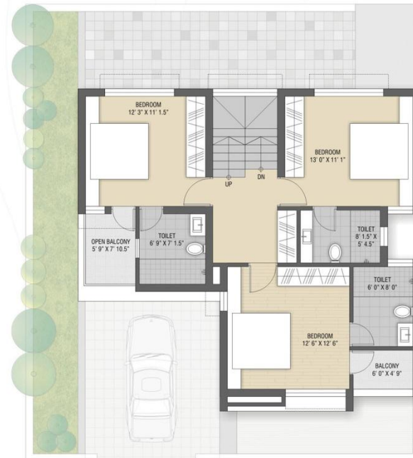
first floor plan