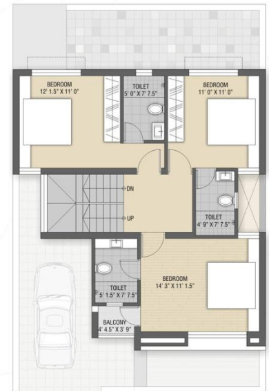
first floor plan