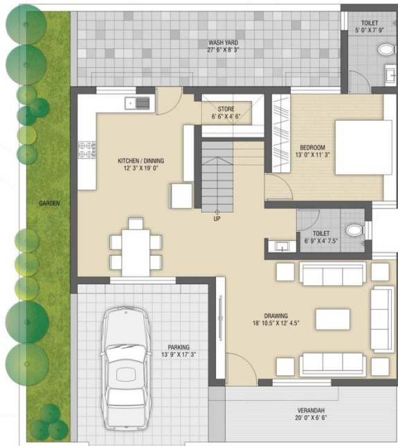
ground floor plan