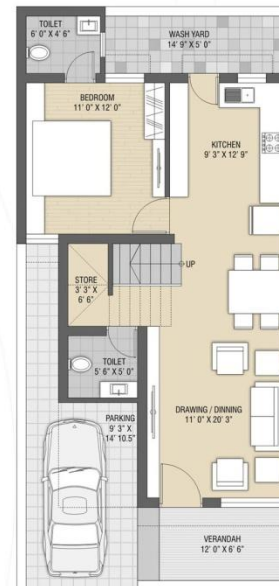
ground floor plan