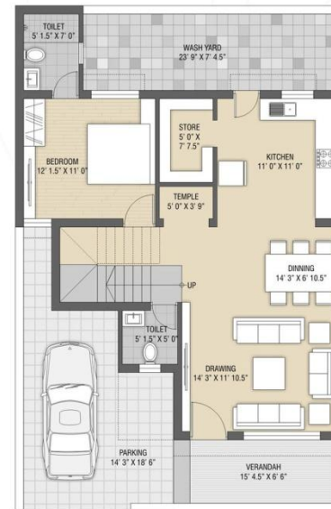
ground floor plan